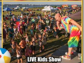
LIVE Kids Show