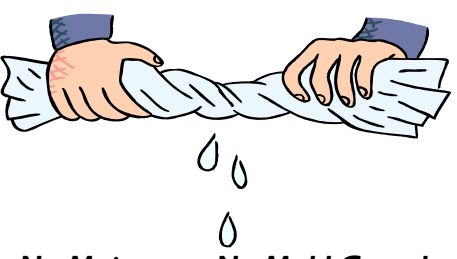
No Moisture = No Mold Growth

As molds grow on building materials they may become destructive. Molds may grow unnoticed, above ceilings, behind walls, in attics and basements or in crawl spaces. Molds can cause staining of walls and ceilings and can begin to break down the studs and joists of