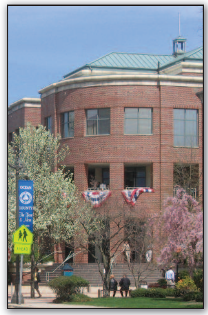
Planning, Engineering, & Roads Annex, Toms River, NJ

One of the major functions of the Ocean County Planning Department is to provide demographic information to municipalities, consultants, educational institutions and the general public. The Ocean County Data Book is intended as a reference document for frequently requested statistical information on Ocean County. The most current information from the U.S. Census, the New Jersey Department of Labor and many other sources have been included in this report. Planning staff will continue to update the online Data Book between printings as additional data becomes available. The online book can be accessed via: www.planning.co.ocean.nj.us/frmDMDataBook