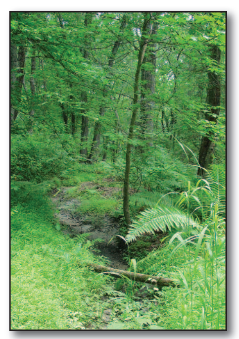
Downs Property, preserved by the Natural Lands Trust Fund Program, Plumsted, NJ

Despite the large growth in population and employment, Ocean County maintains a vast amount of protected open space, which will ensure the balanced land use of the area in the future. Much of the area west of the Garden State Parkway contains large tracts of State Parks, Forest and Wildlife Management Areas. In addition, about 24,575 acres east of the Parkway are protected under the Edwin B. Forsythe National Wildlife Refuge. The Barnegat Bay and Little Egg Harbor, which stretch nearly the entire north-south length of the County, were recently added to the US National Estuary Program and will be the subject of continuing environmental protection efforts.