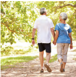
Free Weekend Nature Walks at 2 pm

We provide environmental programs to Ocean County groups including schools, Scouts, clubs, churches, and civic organizations free of charge. Outreach programs are available for groups who may not have transportation to our facility. All groups planning to visit our park must make arrangements in advance. Please contact the Cooper Environmental Center at 732-270-6960 to schedule a program.