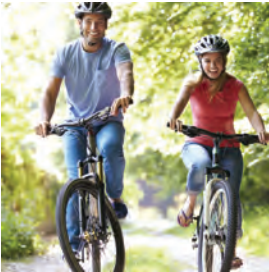
Free Loaner Bikes & Discovery Backpacks

A stunning collection of native and cultivated plants provide nectar and shelter for hummingbirds and a variety of butterflies. The garden is open year-round, but is most active from mid-May to mid-October.