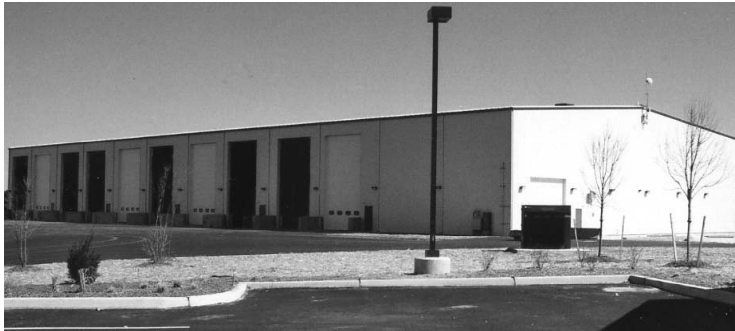
The New Ocean County Recyclables Transfer Station at 379 Haywood Road, Stafford Township.