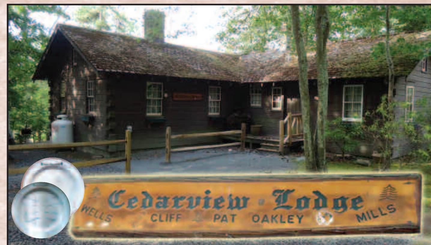
Cedar View Lodge (Conrad-Oakley Cabin) :

The Nature Center at Wells Mills County Park hosts exhibits of the flora, fauna, and local history of Ocean County, specifically the Pine Barrens. The center also has the Elizabeth Meirs Morgan Observation Deck, providing a fine view of the Wells Mills Lake and forest of the park.