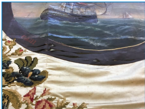
Tears in silk before repairs.

Hart is hoping the work will be completed by fall; the plan is to display the banner at the soon-to-be opened Cedar Bridge Tavern, given its time period and proximity to Tuckerton. The Society just wants to maximize and optimize the banner's visibility.