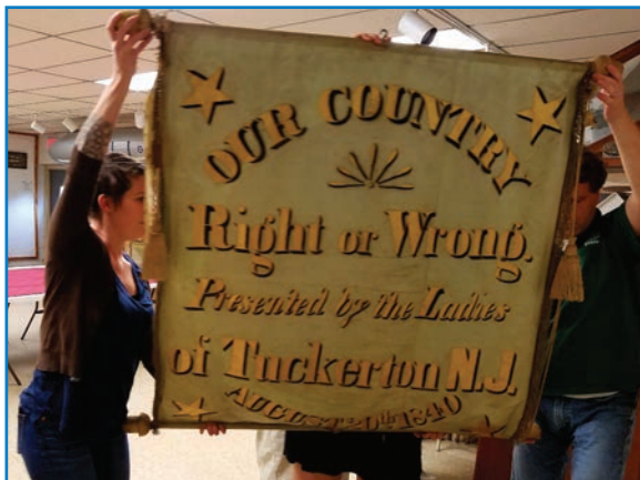
Experts from Boro 6 examine the banner.

They will work with a company to construct a glass display case. The banner needs to be visible