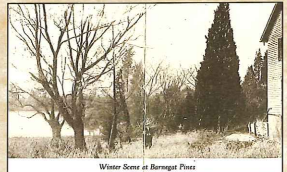
Winter Scene at Barnegat Pines

BARNEGAT PINES You Will Like It Your Wife Will Be Charmed Your Kiddies Will Be Thrilled