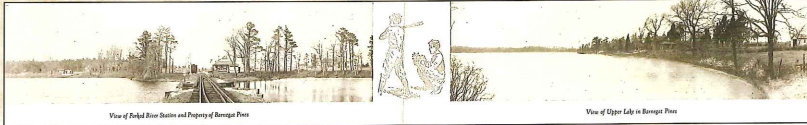
View of Forked River Station and Property of Barnegat Pines