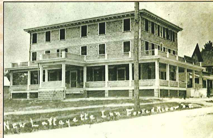
New Lafayette House, stood on site of old one, burned 1915.