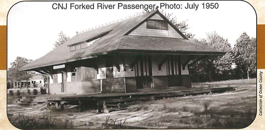
Collection of Ocean County