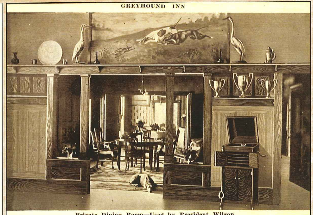
Private Dining Room—Used by President Wilson