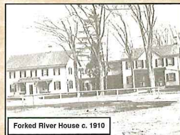
Forked River House c. 1910