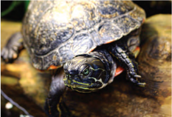
Live reptiles and fish

Interactive exhibits of the local history, wildlife and ecology of the Barnegat Bay ecosystem