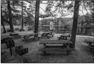
Ocean County Park Lakewood 500 persons