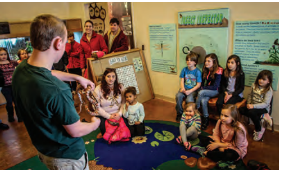
programs, activities and presentations for all ages.

Ocean County purchased the property from Beachwood in 2000. Originally planned as Ocean County's third public golf course, environmental restrictions shaped Jakes Branch County Park into the facility you see today. In order to protect the sensitive ecology of the park, only 40 of the 400 acres were developed. The result is Ocean County's first park to offer both active and passive recreation at a single location.