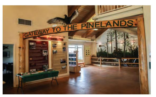
exhibits about the history, wildlife, and ecology of the Pinelands...

The nature center provides natural education through: