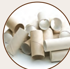
Toilet Paper Rolls