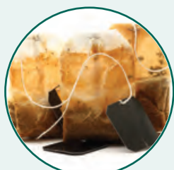
Tea Bags (Plastic Free)