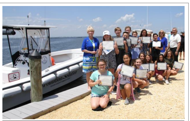
Lavallette Elementary 7<sup>th</sup>-graders celebrate winning the boat-naming contest for the new Brick pumpout boat, the "Pollution Solution."

• Ocean County educates and outreaches to the public about its pumpout boat program via many methods and activities. A convenient rack card is printed annually with tips and captains' contact information, and is distributed by the captains and by County staff at events. In addition, Clean Vessel Act staff exhibit program info at marine trade shows