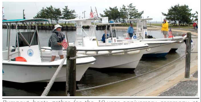
Pumpout boats gather for the 10-year anniversary ceremony at Berkeley Island County Park.<sup>1</sup>

The Ocean County Pumpout Boat Program is the recipient of a number of awards, including the Governor's Environmental Excellence Award in the area of Water Resources and a Program Excellence Award from the National States Organization for Boating Access (SOBA).