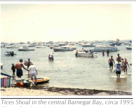
Tices Shoal in the central Barnegat Bay, circa 19

• The main challenges involved with establishing and maintaining a pumpout program included finding operators willing to make a long-term commitment to the operation, staffing and maintenance of the boat(s), and making the public aware of the existence and benefits of utilizing the service.