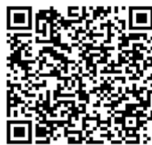
Scan for Paper Application