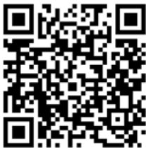
Scan for Online Application