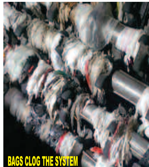
BAGS CLOG THE SYSTEM