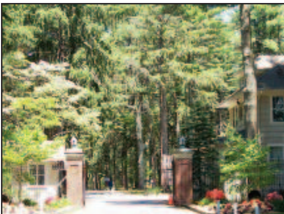
Ocean County Park Main Entrance.