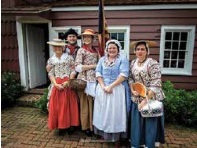
Photo Caption: Monmouth County Historical Association costumed interpreters welcoming guests at last year's 4th of July Celebration.

After the reading, Christ Church will be drawing the winners of their raffle to climb their clocktower. Tickets will be on sale at the event.