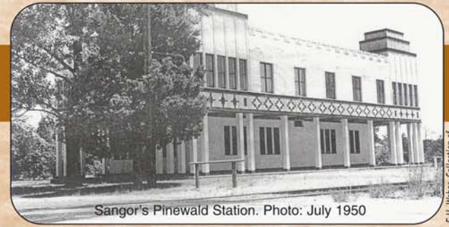
Sangor's Pinewald Station. Photo: July 1950