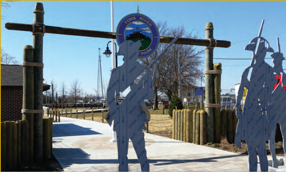
Huddy Park Renovations Under Construction