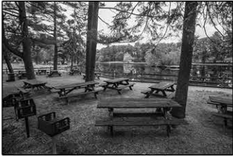
Ocean County Park Lakewood 500 persons