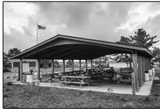
John C. Bartlett Jr. County Park at Berkeley Island 110 persons