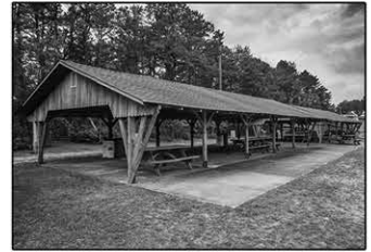
Robert J. Miller Air Park Berkeley Township 100 persons