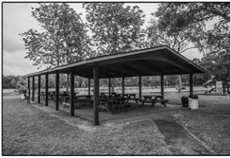
Patriots County Park Jackson 80 persons