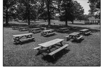
Stanley Tip Seaman County Park Tuckerton 95 persons