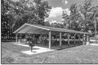
A. Paul King County Park Manahawkin 110 persons