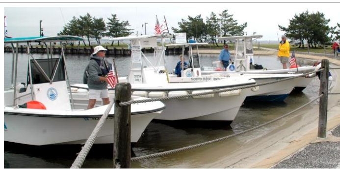
Pumpout boats gather for the 10-year anniversary ceremony at Berkeley Island County Park. 1

The Ocean County Pumpout Boat Program is the recipient of a number of awards, including the Governor’s Environmental Excellence Award in the area of Water Resources and a Program Excellence Award from the National States Organization for Boating Access (SOBA).