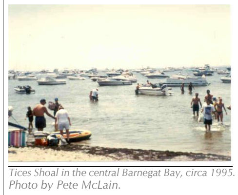
Tices Shoal in the central Barnegat Bay, circa 1995.