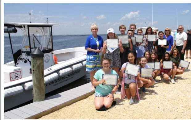
Lavallette Elementary 7 th -graders celebrate winning the boat-naming contest for the new Brick pumpout boat, the "Pollution Solution."